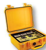
Yellow Box Portable O 2 Analyser