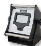
GazTrak Portable oxygen & moisture measurement