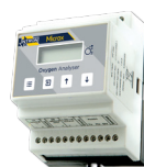
Microx Oxygen Analyser