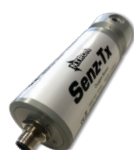
SENZTX Oxygen Transmitter